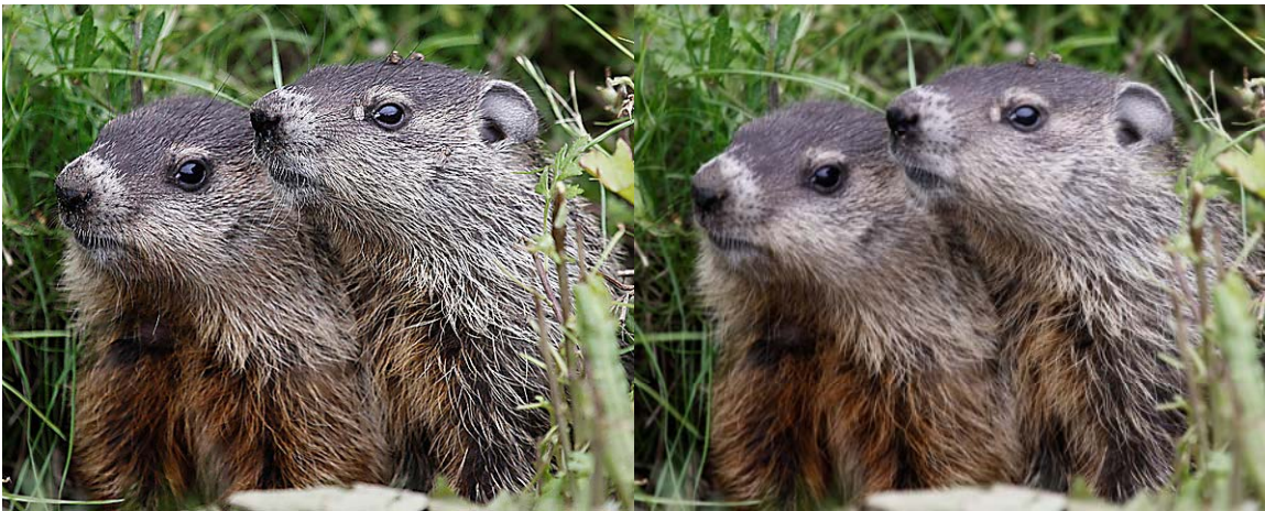
Resized then sharpened

should be at the same size as the intended printing on press. In the images below, the Unsharp Masking was applied at the same settings for two alternate sizing methods. The image on the left was first sized for this document (2.4 in x 3 in) and then the filter was applied. The image on the right, the Unsharp Masking was applied first (image size 8 in x 10 in), and then the image was resized to the document image size. As you can see, there is a much more pronounced effect on the left side image and the reduced size image has lost all of its apparent sharpness. The closer you can be to the final image size for printing prior to the use of the Unsharp Masking filter, the better the results will be.