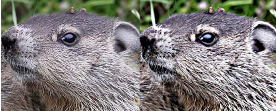
Low radius setting

Radius: This controls the width (in pixels) of the edges that the Unsharp Mask filter will modify. Your range varies from 0.1 pixels for fine control to 250 pixels for broader sharpening effects. Higher radius settings may cause unwanted halos in the image. For newspaper printing a range of 0.6 to 1.8 is suggested.