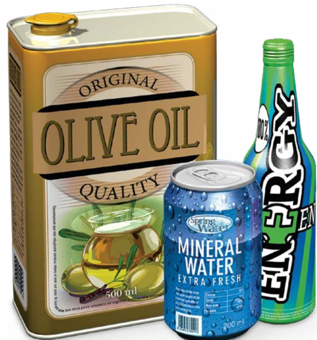
Sun Chemical offers a wide range of metal decorating inks and special effects for two-piece and three-piece cans, tubes, and monoblocs.